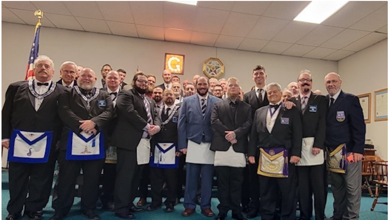
The third degree at Van Rensselaer #86